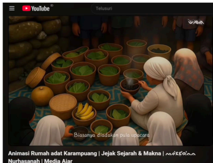
Figure 3. Publication of Local Cultural Animation Videos on the YouTube Platform