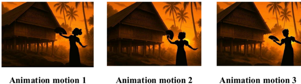
Figure 2. Animated results driven by AI prompts

The development process produced a structured AI-generated animation video approximately eight minutes in duration, organised into four sequential narrative segments corresponding to the storyboard design: (a) historical narrative of the origins and founding context of the Karampuang Traditional House; (b) architectural visualisation detailing structural components and their philosophical interpretations; (c) explication of embedded cultural values and their continuing relevance to Sinjai's indigenous community; and (d) documentation of the heritage site's contemporary condition and institutional preservation imperatives. The animation incorporated synchronised voiceover narration in Indonesian, culturally appropriate background instrumentation, and textual annotations aligned with the visual sequences in accordance with principles of multimedia learning. Following expert validation and revision, the completed product was published on an accessible YouTube channel to support both classroom and independent learning contexts.