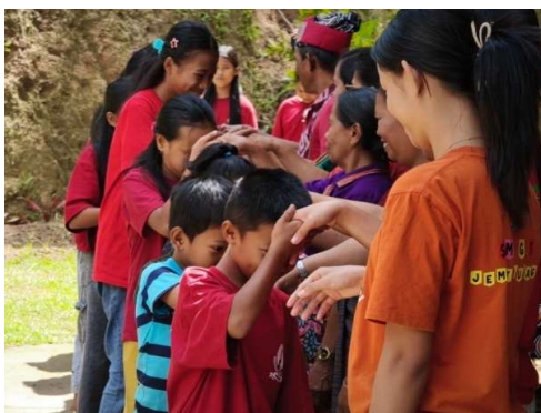
Figure 6. Students greet the facilitator

Sipakaboro' (mutual care/love) and siangga' (mutual respect) regulate the affective and tonal dimensions of social life in Torajan culture. Sipakaboro' is transmitted through oral narratives portraying communal care, through the visible solidarity of ritual participation, and through cooperative work. Siangga' governs protocols for addressing elders and facilitators, behaviour in ritual settings, and recognition of each community member's contribution. Multiple informant accounts — from elders, parents, and facilitators — consistently report increased courtesy, improved speech registers, and greater empathy in learners following participation, providing convergent validation of value internalisation.