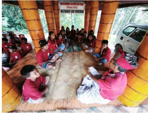
Figure 7. Students listen to Kada learning in the sedan sarong