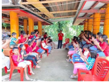
Figure 4. Learning Folk Tales, Riddles ( Karume ) and Pantun ( Londe )