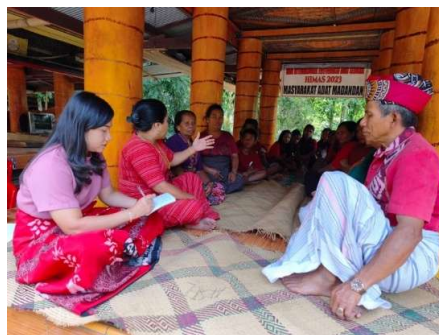
Figure 3. Ma'kombongan simulation

The school functions as a social institution maintaining community harmony through kombongan adat (customary deliberation) the traditional mechanism of communal decision-making and peaceful conflict resolution. Through simulations of kombongan processes and case studies of historical customary resolutions, learners acquire practical competencies in principled dialogue, guided by the ethics of sipanundu' , Sipakaboro' , and siangga' . A senior elder observed: "I see many positive changes. Children and young people are more respectful of their elders, peers, and teachers, and are more interested in participating in community adat activities." (Elder, February 2026).