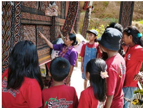
Figure 2. Learning activities about Toraja carvings

Comprehensive analysis of interview data, observational records, and institutional documents identified seven integrated roles through which the school operationalises its cultural education mandate. All roles are rooted in the founding philosophy of sipanundu' — mutual support, guidance, and respect — and are expressed through the school's seven strategic missions, from community-based learning to the cultivation of critical consciousness and cultural sovereignty.