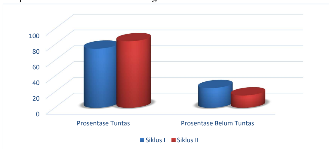
Table 4 above obtained the following information: (1) there was an increase in the percentage of students who had completed learning from pre-action compared to cycle I of 21.88%, (2) there was an increase in the percentage of students who had completed learning from cycle I compared to cycle II of 9 ,38 %. Furthermore, to find out comparisons between actions, the researcher presents data on students who have completed and those who have not in figure 1 as follows :