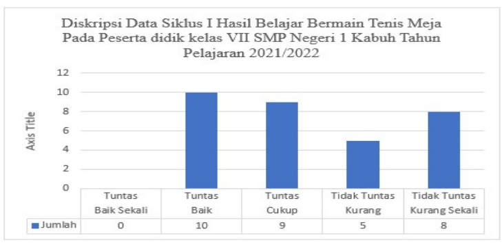
Figure 1. Results for Cycle I